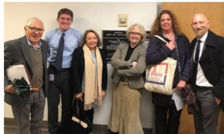
CoPTIC advocates meet with Sen. Jerry Hill ahead of introduction of SB 900.

3) AB 5 continues to plague professionals, including linguists [in Spanish]: https://laopinion.com/2020/02/26/la-ley-ab-5-continua-afectando-negativamente-a-trabajadores/ [If needed, ask CoPTIC for an English translation, expertly prepared by a well-trained California linguist.]